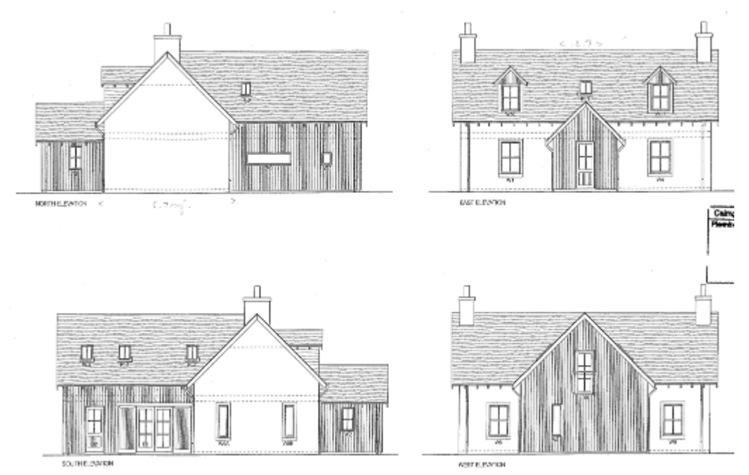
Fig. 5: Proposed elevations

would be positioned to the rear South side. Drainage would be to the existing septic tank and soakaway.