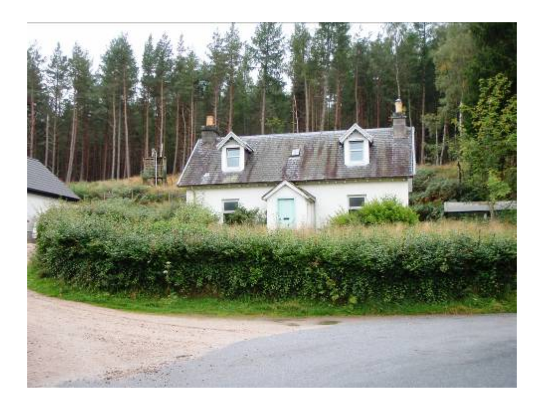
Fig. 2 Front of Feshie Cottage