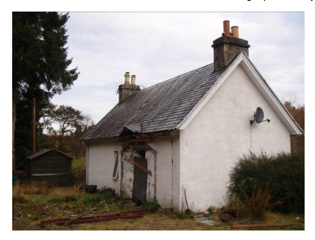
Fig. 3 Rear of Feshie Cottage